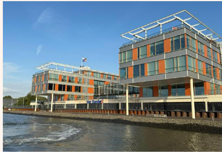
Van Oord Headquarters Rotterdam

What were your main takeaways from the meeting at the Van Oord office?